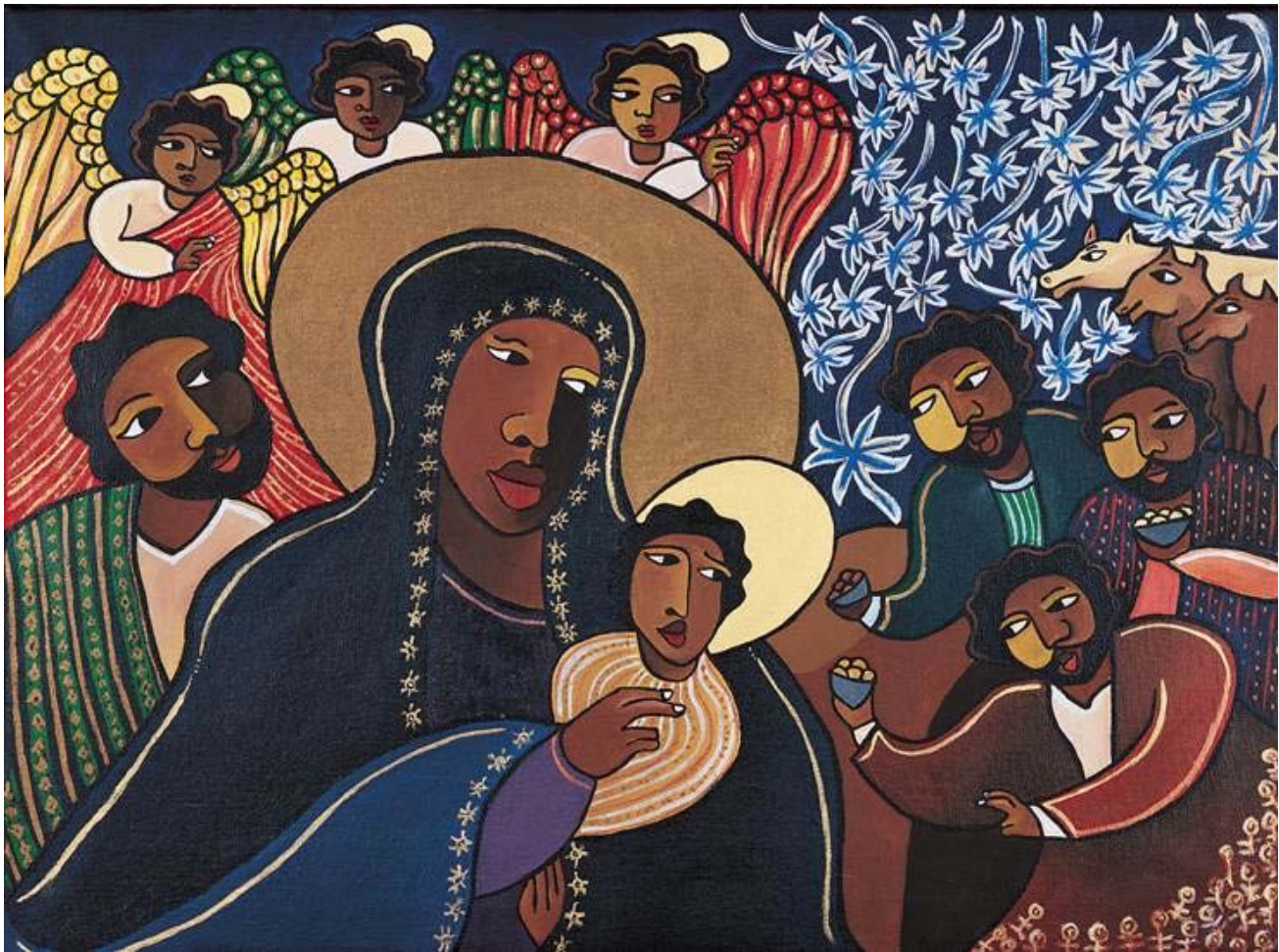
Nativity, 1995

Con ese fin nos esforzamos ser acogedores, receptivos, confiados y devotos en todo lo que hacemos.