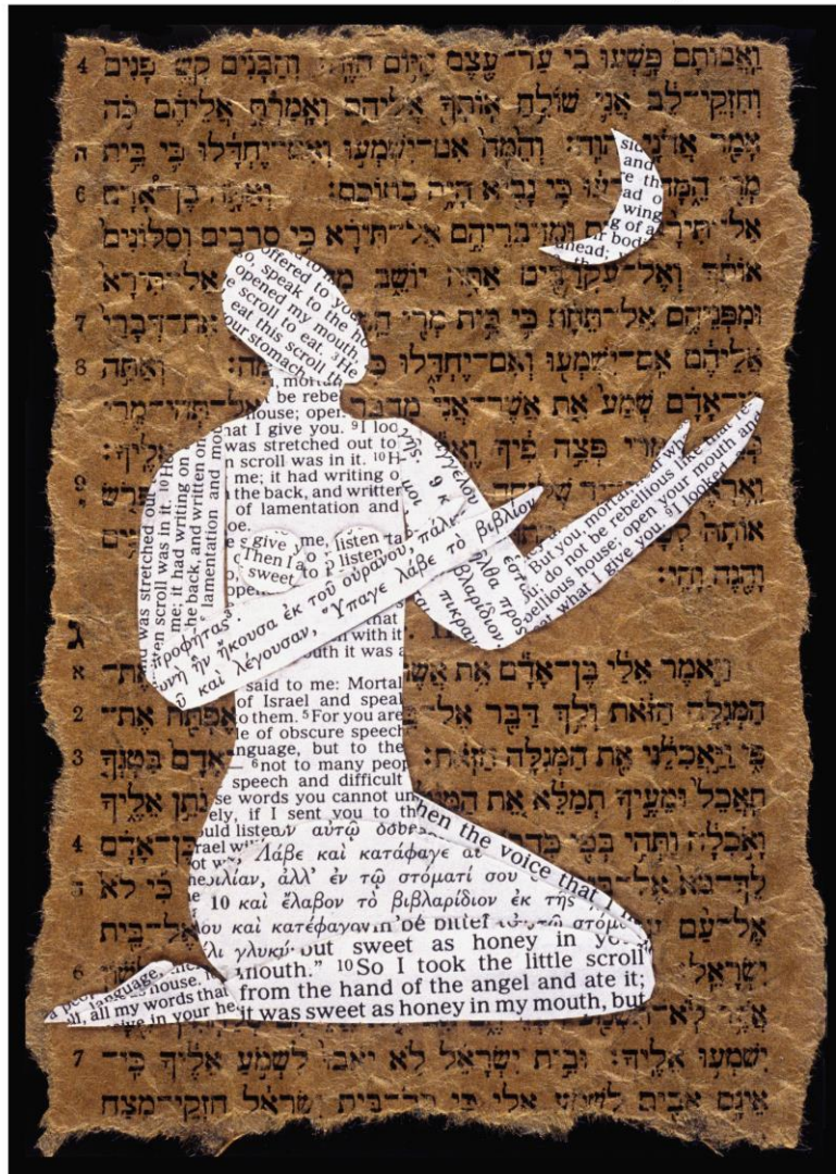
All the Ways I Am Words