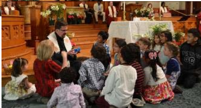
Easter 2015 at Calvary