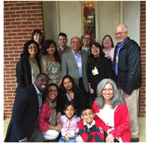
Calvary members, present and past, at the 2015 Alliance Gathering in Atlanta, Georgia.