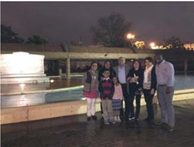
Calvary members standing by the tomb of Dr. Martin Luther King, Jr in Atlanta