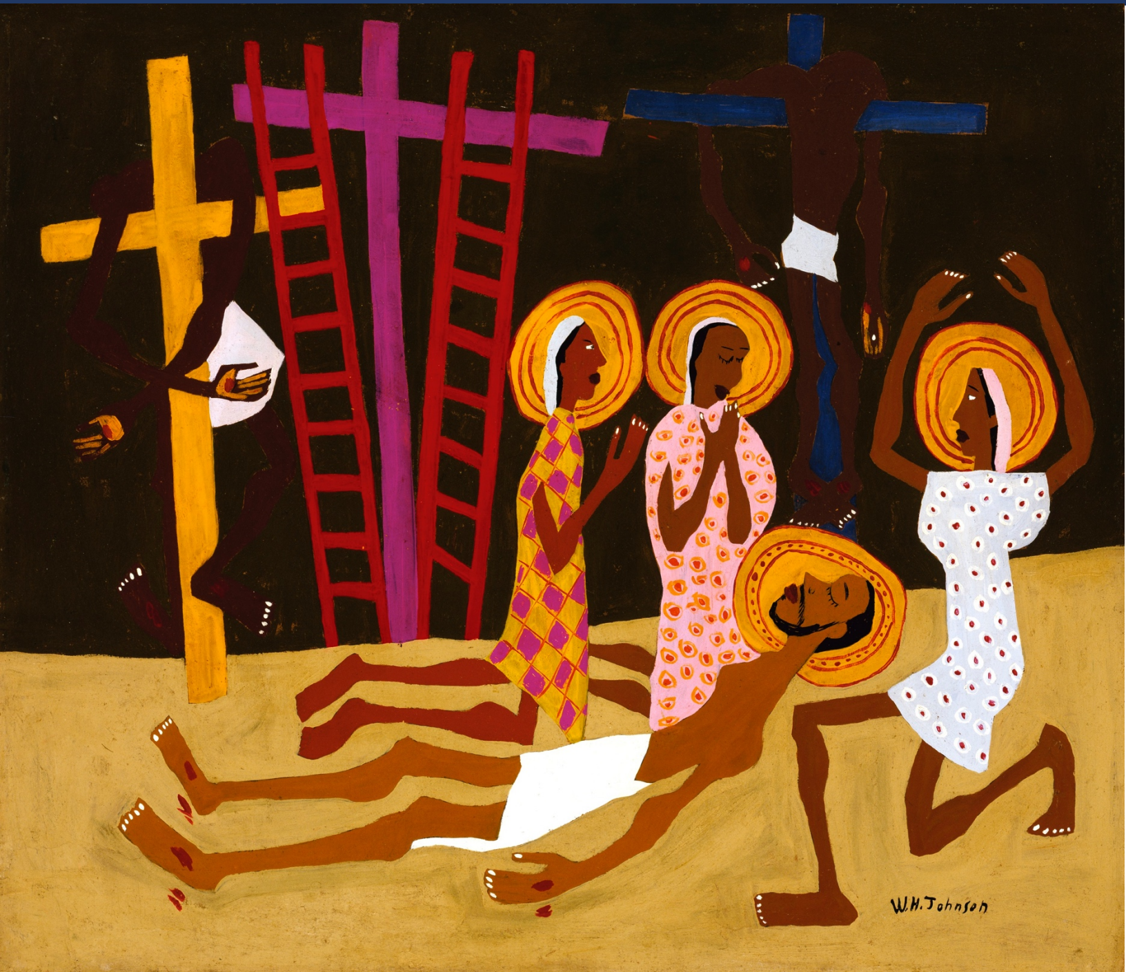
William H. Johnson, Lamentation , ca. 1944, oil on fiberboard, 29 \frac{1}{8} x 33 \frac{1}{4} in. (74.0 x 84.6 cm.), Smithsonian American Art Museum, Gift of the Harmon Foundation, 1967.59.981