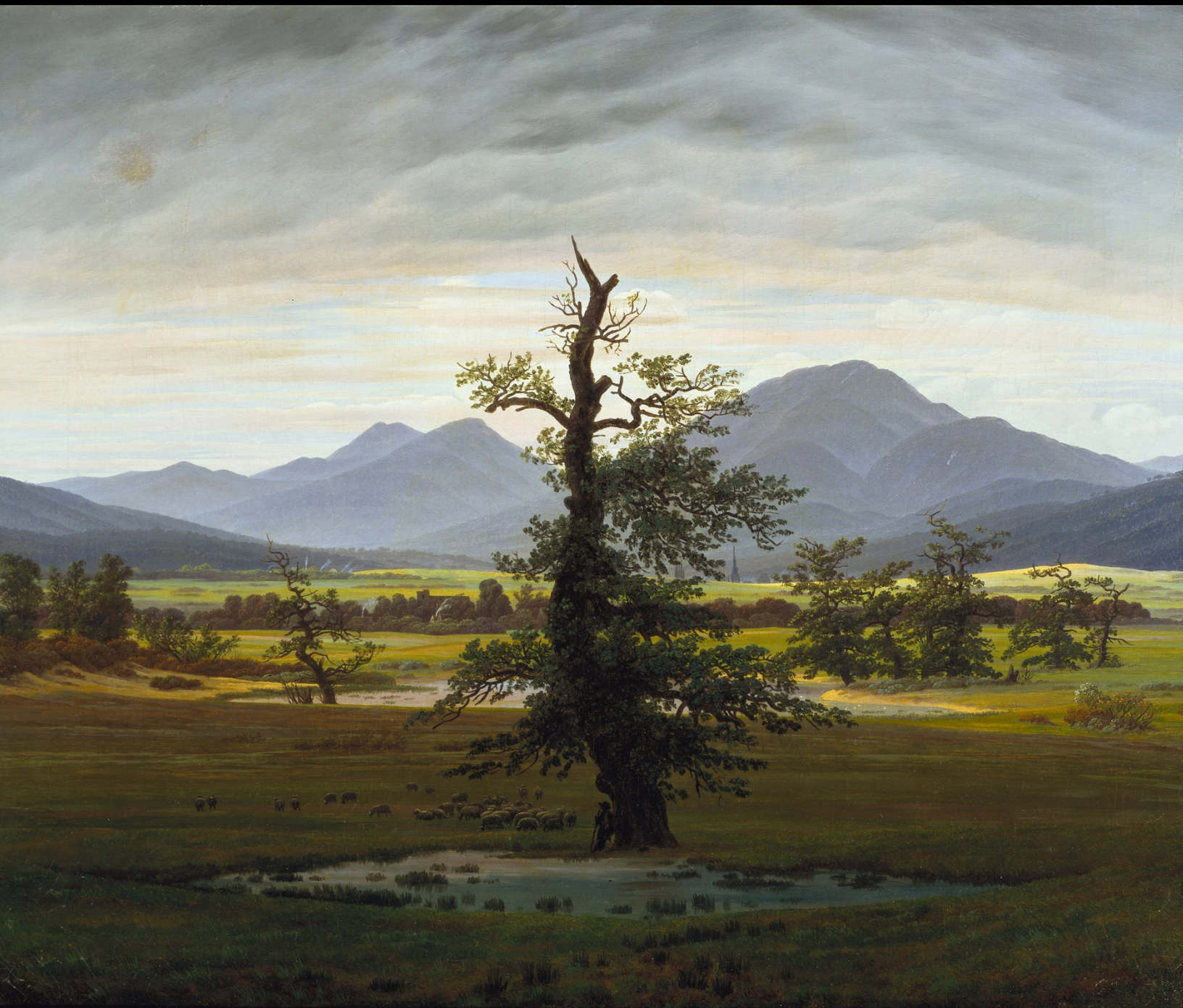
Der einsame Baum (trans. "The Lonely Tree") Caspar David Friedrich, 1822