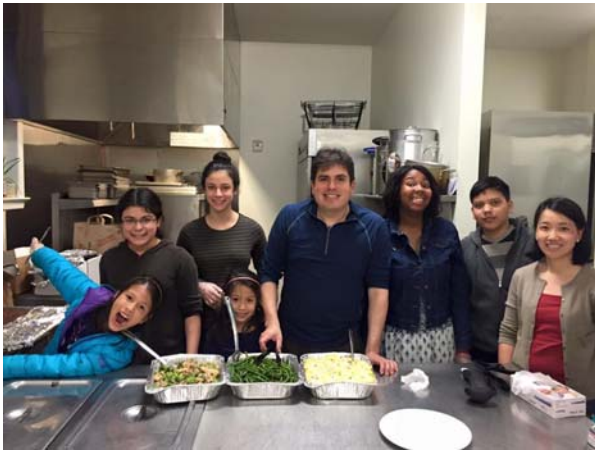
Youth St Calvary Women's Shelter