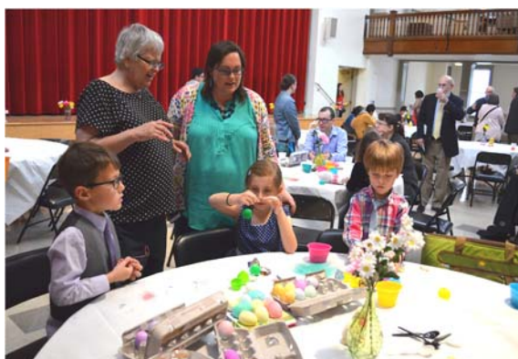
Calvary Children dying Easter eggs