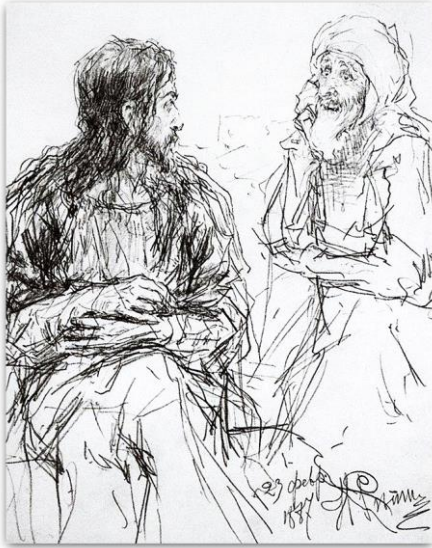
Ilya Repin, Christ and Nicodemus (1887)

We are an ecumenical, multi-racial, multi-ethnic Christian body that reaches out to the world with the Good News of Jesus Christ. To that end we strive to be welcoming, responsive, trusting and prayerful in everything we do.