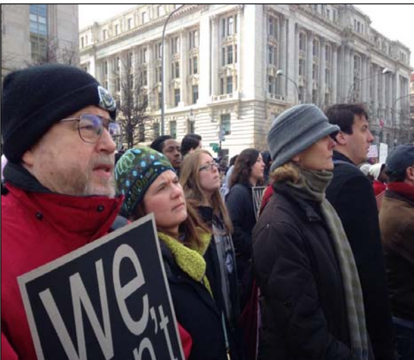
Calvary members protesting police brutality