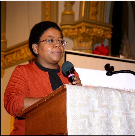
Jackie Wright moderating WIN event with DC Mayor Bowser