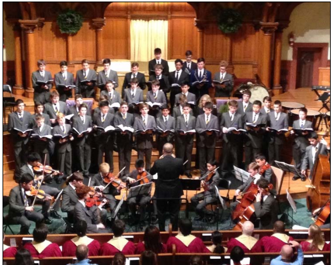
Global Christmas Weekend Concert